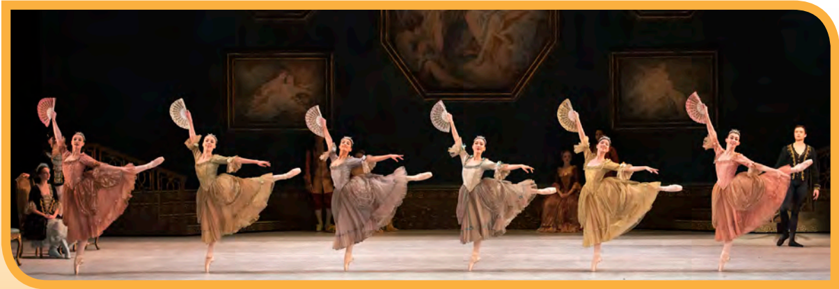
Atlanta Ballet performs Marius Petipa & Lev Ivanov's Swan Lake.