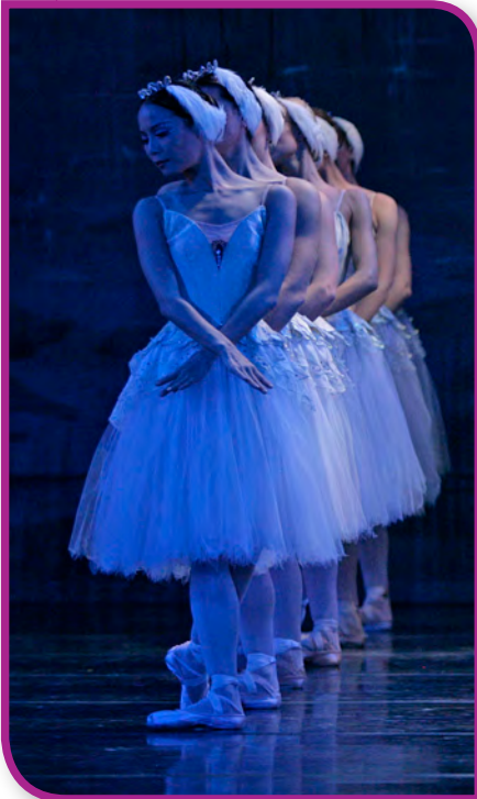
Swan Lake: Photo by Charlie McCullers