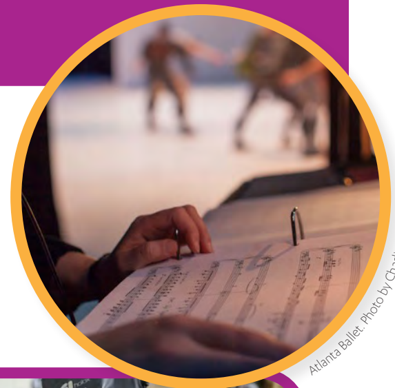
Atlanta Ballet.

All dancers who perform dances by themselves.