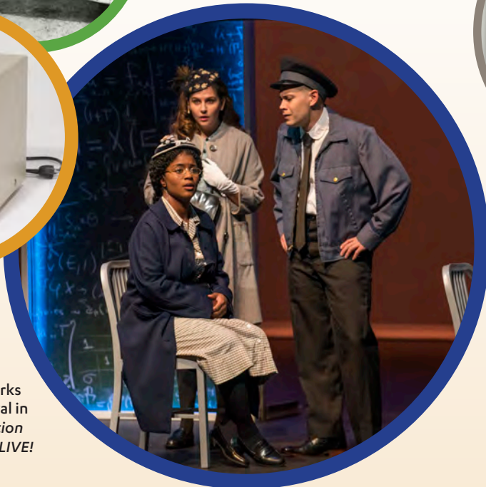
Rosa Parks portrayal in Innovation Nation LIVE!