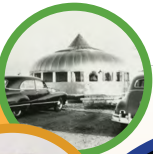
Buckminster Fuller’s Dymaxion House