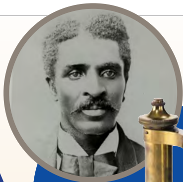
George Washington Carver and his microscope