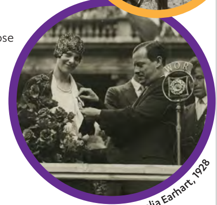
Amelia Earhart, 1928